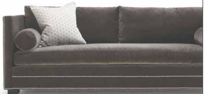
BARDOT 88" SOFA in boulevard-café, a decadent velvet ($4480) $3325 , special orders from $3730

Mitchell Gold + Bob Williams CELEBRATING 25 YEARS OF COMFORT