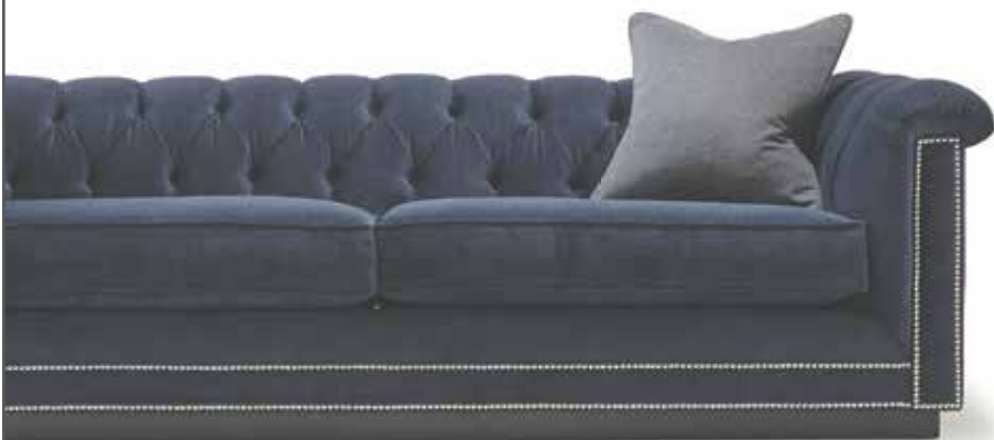
BARRYMORE 94" SOFA in eller-navy, a bold chenille ($3360) $2495 , special orders from $3360