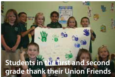
Students in the first and second grade thank their Union Friends