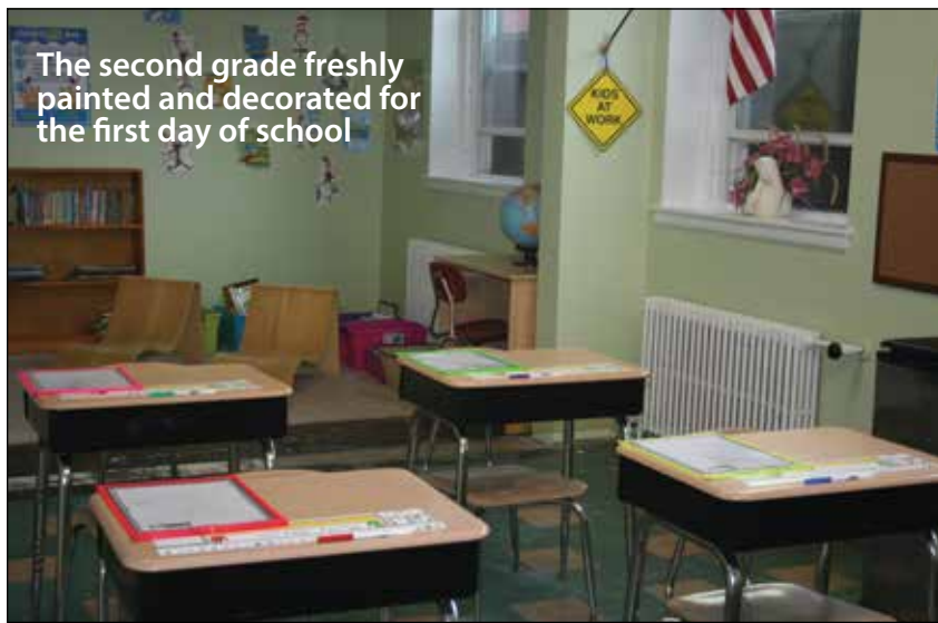
The second grade freshly painted and decorated for the first day of school