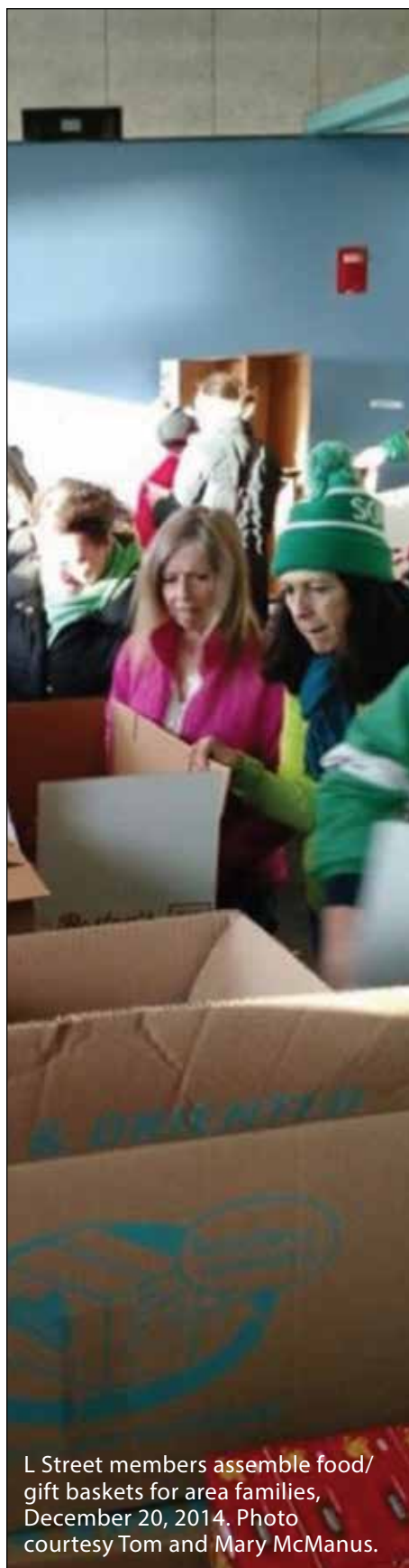
L Street members assemble food/gift baskets for area families, December 20, 2014.

year 224 runners trained with LSRC, to run Boston and other spring marathons. Runs begin at 8 am at the M Street entrance of the Curley Community Center (we will be providing a free shuttle from the skating rink at Farragut Circle). Marathon training begins January 11th. More information about LSRC, including how to join and run details, can be found at lstreet.org .