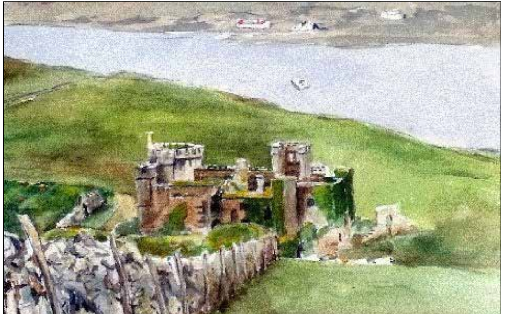
D'Arcey's Castle, Connemara