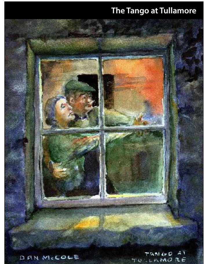
The Tango at Tullamore