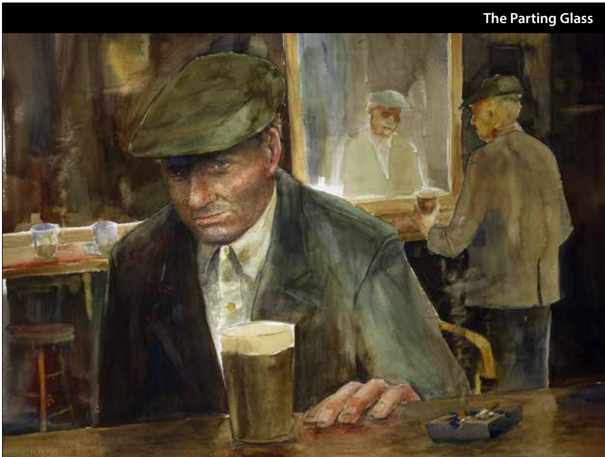
The Parting Glass