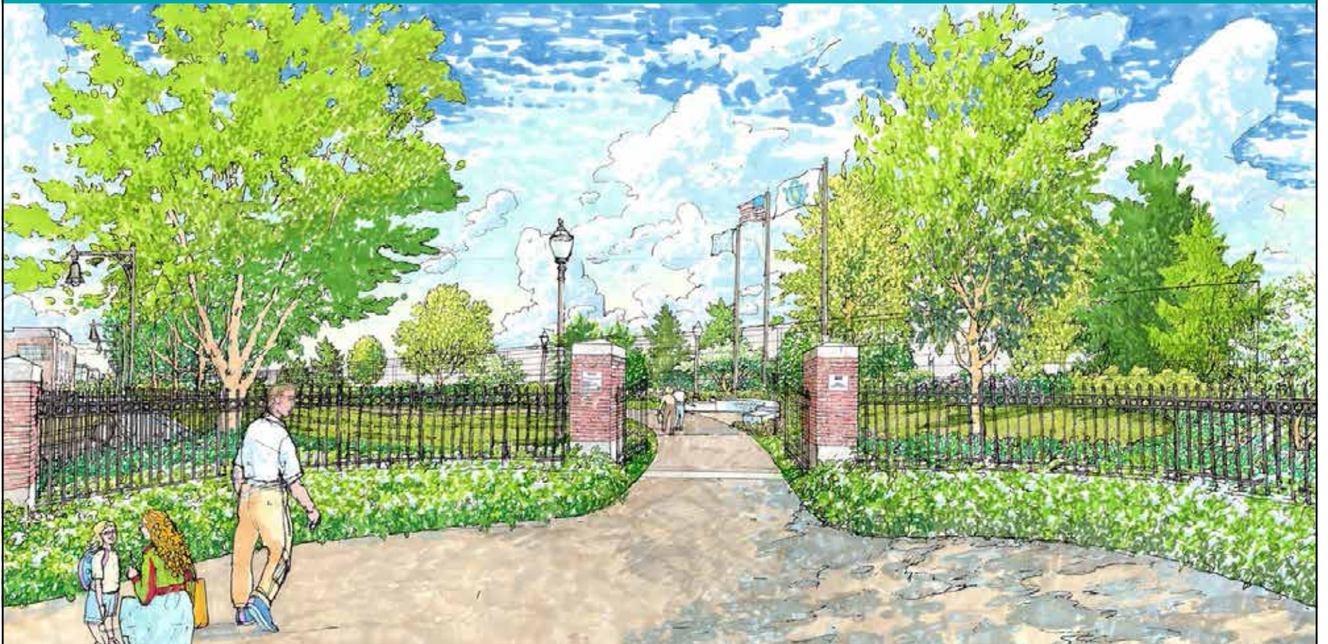
Thomas Butler Memorial Freight Corridor Green Space

Massport is working hard to balance our dual roles as an economic engine and a good neighbor. That's why we're investing $75 million to create the Thomas Butler Freight Corridor which includes state-of-the-art security and will take 400-500 container trucks off of East First Street each day.